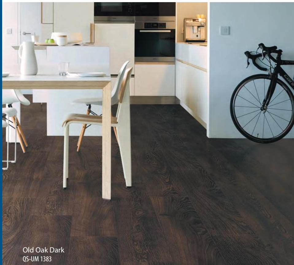
Old Oak Dark QS-UM 1383

Classically elegant floors bring beautiful light and dark nuances for a natural and realistic look.