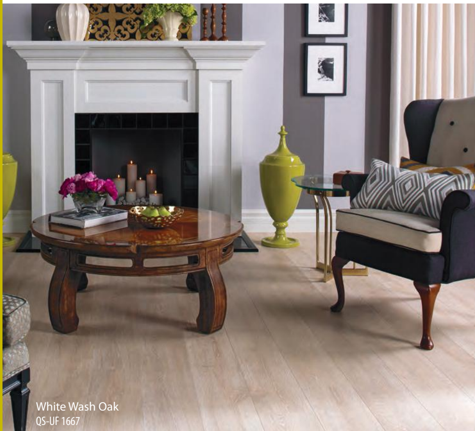
White Wash Oak QS-UF 1667

The Reclaimé Collection features unmatched realism and the visual charm of a timeworn reclaimed hardwood floor. Choose from planks reminiscent of vintage wood.