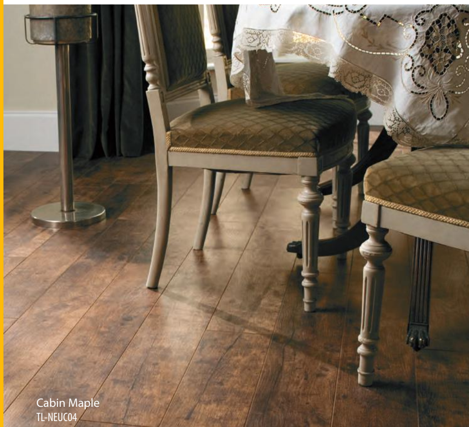
Cabin Maple TL-NEUC04